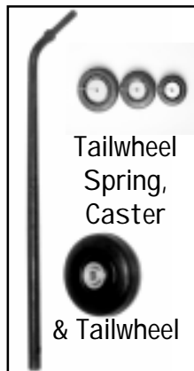
Tailwheel Spring, Caster & Tailwheel