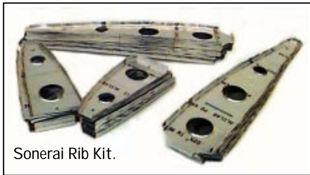
Sonerai Rib Kit.