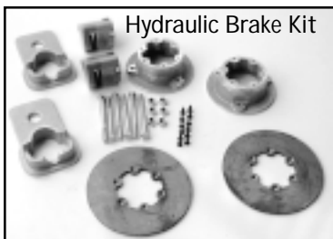
Hydraulic Brake Kit